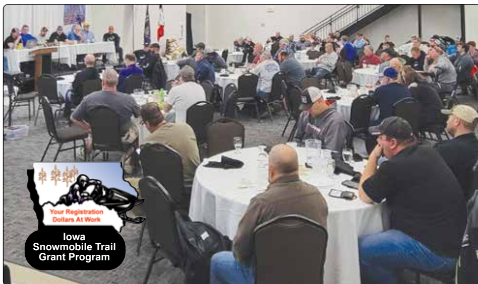
Snowmobile club members fill the reception hall at the Lake Okoboji Resort and Conference Center for the 2024 ISTGP Update at convention.