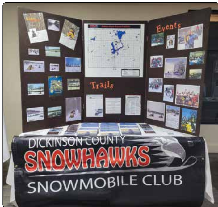
Snowmobile Iowa display at the 2024 ISSA Convention.