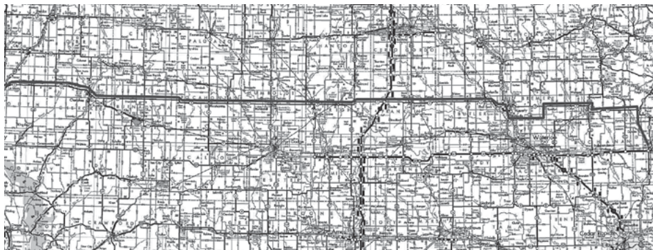
The 2009 planned route basically follows Highway 3 but is subject to change, pending snow cover and trail conditions.